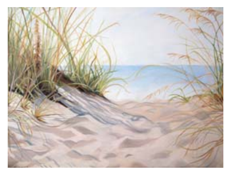
"Path to the Beach" by Jeanette Crawford Baird